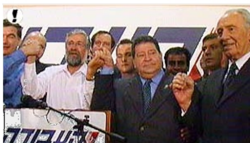
מצנע עם ראשי העבודה. בלי שום עזרה (מחברים

העבודה – 21-22 מנדטים (21-22) – איבדה כמנדט המפלגות הערביות – 9 מנדטים (7-11) מרצ – 8-9 מנדטים (8-9)